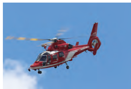
Nagoya Aerial Fire Corps "Hideyoshi"