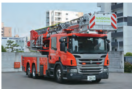
Nagoya City Fire Bureau Ladder Truck

During the conference period, a dedicated shuttle will also be available to transport participants from ANA Hotel to the Misonoza venue.