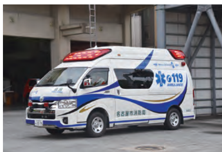
Nagoya City Fire Bureau Ambulance "Blue Eight"